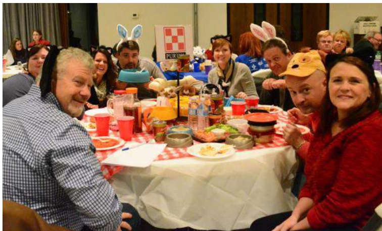
A spirited table from our last trivia night

Sign-ups will be available before and after services on Sunday – spread the word and invite your friends!